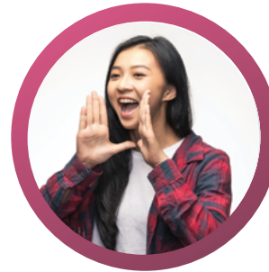
LANGUAGES AND EDUCATION