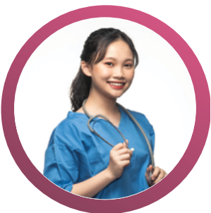
HEALTH AND NURSING