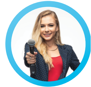
MEDIA AND COMMUNICATIONS