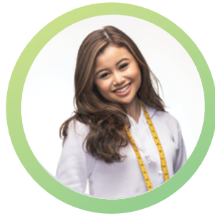
FASHION AND DESIGN