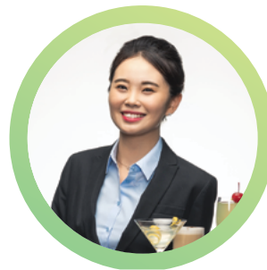
TOURISM AND HOSPITALITY