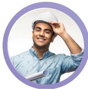
SAFETY AND ENVIRONMENTAL MANAGEMENT